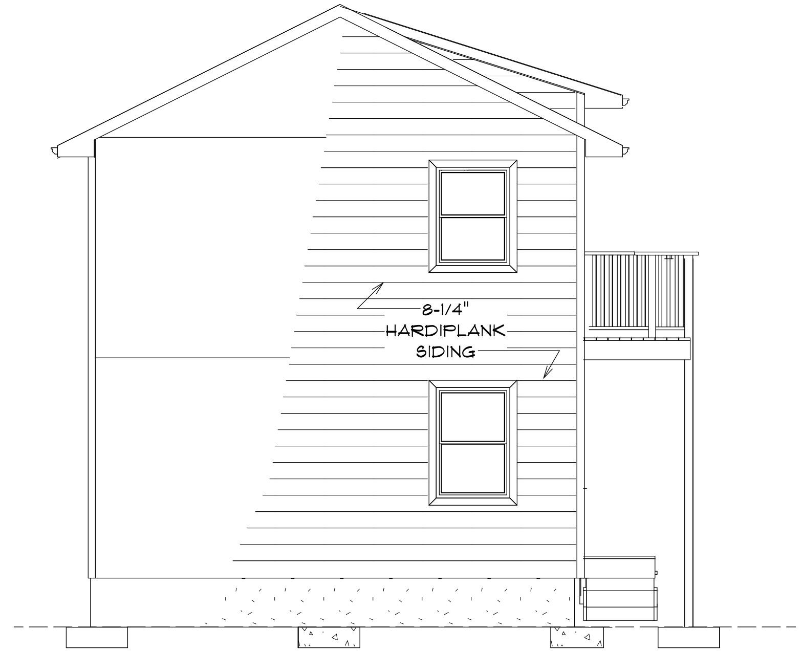
EAST ELEVATION SCALE: 1/4" = 1'-0"