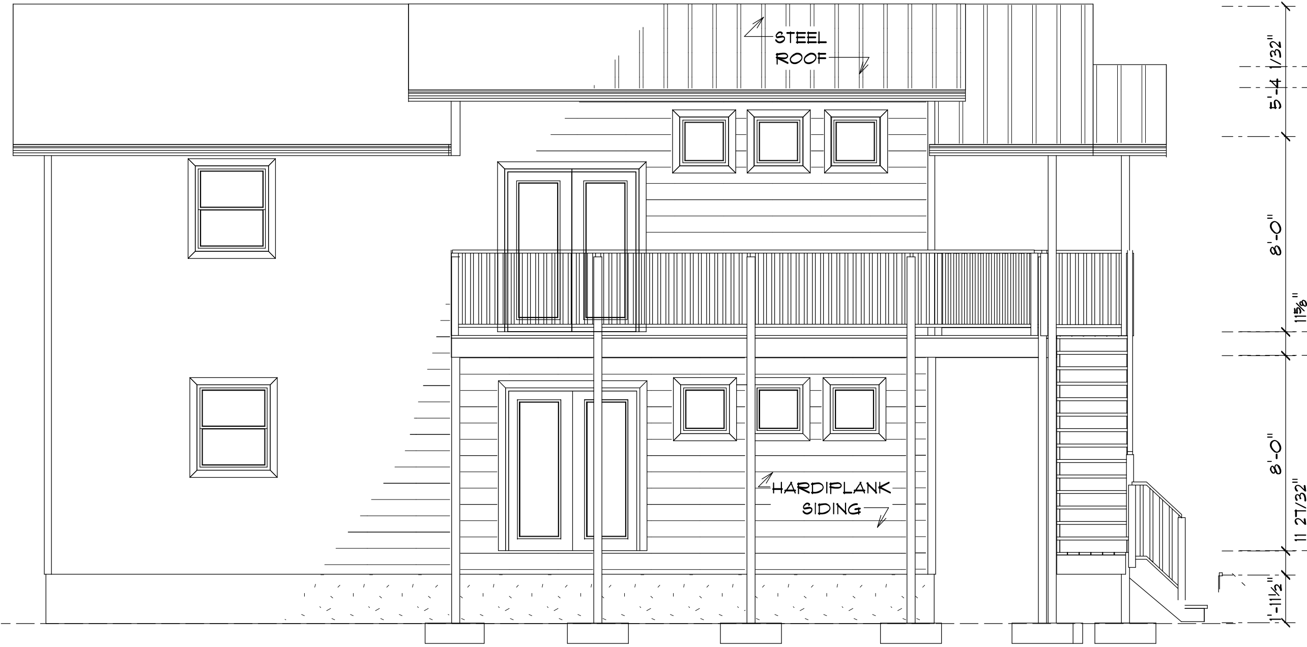
NORTH ELEVATION SCALE: 1/4" = 1'-0"