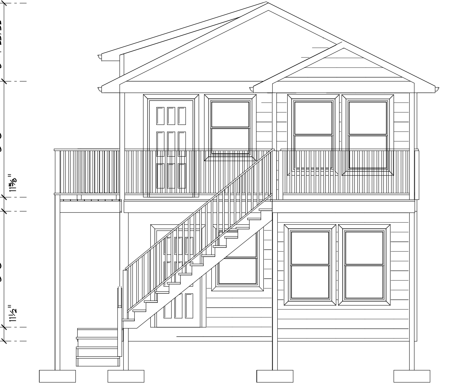
WEST ELEVATION SCALE: 1/4" = 1'-0"